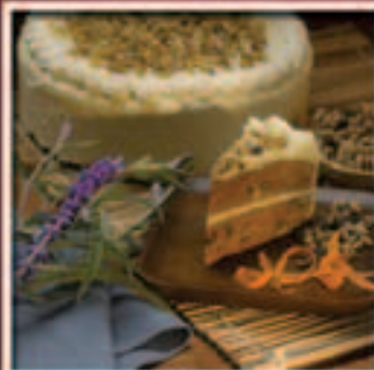
Carrot Cake A moist double layer cake brimming with grated carrots, real pineapple, and chopped walnuts, spiced with a hint of cinnamon and nutmeg, and smothered with our own cream cheese icing.