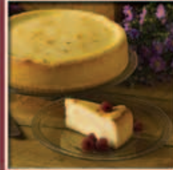
Creamy Cheesecake New York style cheesecake as it should be. A velvety smooth body of fresh cream cheese and sour cream is set in a real graham cracker crust and dusted with graham cracker crumbs. Perfection!