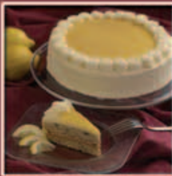
Lemon Torte Bursting with natural lemon flavor, this moist, nutty layer cake hosts a lemony cream cheese frosting capped with a delightful lemon glaze and rosettes to excite the eye and palate.