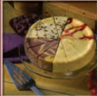
Cheesecake Choices We have taken our four most popular cheesecake flavors and created Cheesecake Choices. The 14 slices of cheesecake include 4 plain, 4 chocolate chip, 3 raspberry, and 3 strawberry swirl.