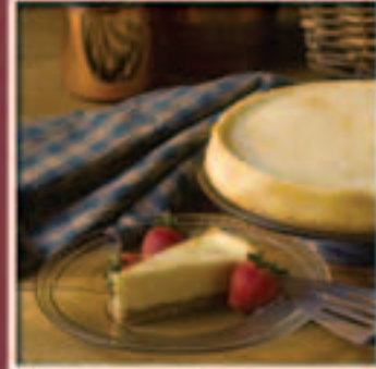
37 oz. Creamy Cheesecake All the goodness of our cheesecake in a smaller size for daintier appetites. A velvety smooth body of fresh cream cheese and sour cream is set in a real graham cracker crust and dusted with graham cracker crumbs.