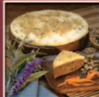
Carrot Cake (single layer) A moist single layer cake brimming with grated carrots, real pineapple, and chopped walnuts, spiced with a hint of cinnamon and nutmeg, and topped with our own cream cheese icing.