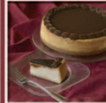
Chocolate Ganache Cheesecake For a gourmet cheesecake, try our regular cheesecake topped with a glaze of chocolate ganache within a decorative border.