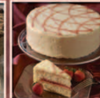
Touch of Strawberry Cake A thin layer of strawberry glaze and cream cheese icing is sandwiched between two light-colored layers of a vanilla-flavored cake. Our cream cheese frosting covers the cake with just a drizzle of strawberry decorating the top.