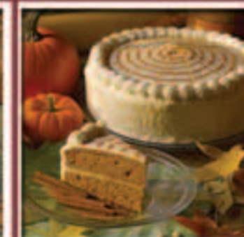
Pumpkin Spice Cake This double layer cake is baked with real pumpkin, spiced with cinnamon and ginger. It is covered and decorated with our own cream cheese icing, and topped with a caramel swirl. A delightful autumn treat that will please everyone.