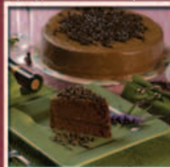
Chocolate Crème Cake Made with buttermilk to create an unforgettable chocolate cake. This two-layer delight is frosted with our own chocolate mousse and topped with mini-gourmet chocolate curls.