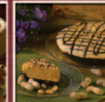
Peanut Butter Pie This peanut lover's delight starts with a chocolate crumb crust covered with a thin blanket of dark chocolate, which cradles a delicious blend of cream cheese, whipped cream and real peanut butter. A drizzle of chocolate and sprinkle of peanuts completes this treat.