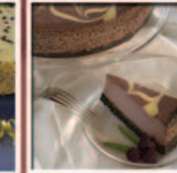
Raspberry Cheesecake Black raspberry purée gives this cheesecake a true, consistent appearance and flavor that is enhanced with a chocolate crumb crust. It's a combination that is sure to delight your tastebuds.