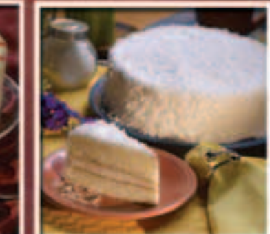
Coconut Cake A light buttery double layer white cake with delicious whipped icing smothered in fresh coconut.