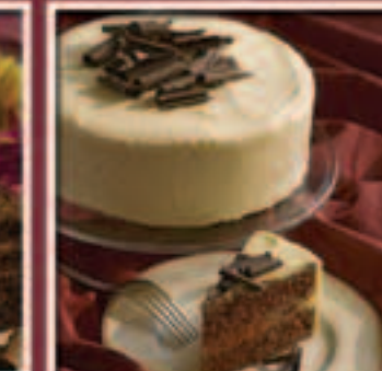
Black Forest Cake A blanket of cherries and our own chocolate mousse is the surprise found between the layers of this fine chocolate cake. Cream cheese icing and a mound of chocolate curls top this special old-time recipe.