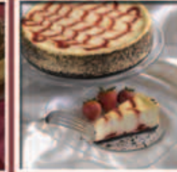
Strawberry Swirl Cheesecake This creamy cheesecake is bursting with pockets of strawberry purée, topped with a decorative design, and complemented by a chocolate cookie crumb crust.