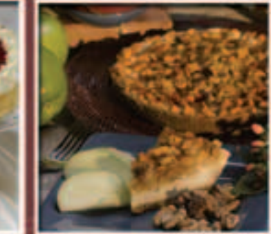
Apple Bavarian Cheesecake Mom's apple pie made our way...with cheesecake. A graham cracker crust cradles a lavish layer of cheesecake laced with apple pieces, topped with another layer of apples and sprinkled with walnuts (slices best before entirely thawed).