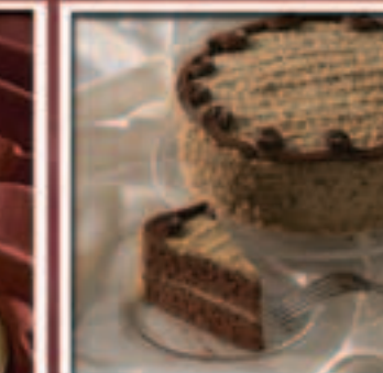
German Chocolate Cake A light buttermilk double layer chocolate cake topped with the traditional walnut and coconut icing. Dark sweet chocolate piping trims this Old World favorite.