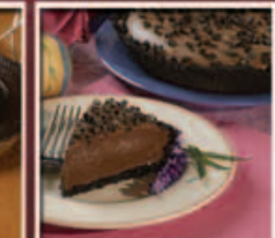
Chocolate Mousse Pie Mountains of our deliciously light chocolate mousse rest on a chocolate cookie crust. A generous sprinkle of mini-gourmet chocolate curls tops this taste adventure.