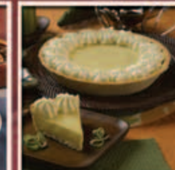
Key Lime Pie A tart, creamy filling made with Key West Lime Juice direct from Florida with no artificial colors, all nestled in a flaky dough crust.