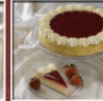
Strawberries 'n Cream Cheesecake A velvety smooth cheesecake made of fresh cream cheese and sour cream set on a graham cracker crust and topped with strawberry purée and whipped cream rosettes.