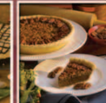
Pecan Pie A flaky dough crust packed with pecans in a dark rich syrup, but not excessively sweet.