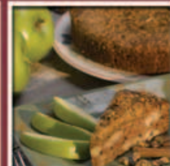
Apple Walnut Crumb Cake Spice is nice in this deliciously moist cake featuring diced apples, English walnuts, cinnamon and nutmeg. Perfect as a dessert or breakfast cake. It's even better warmed and served with ice cream or whipped cream.