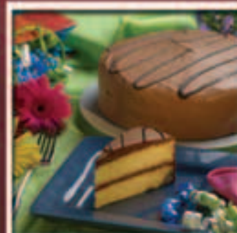
Yellow Cake An old fashioned yellow cake made with real honey and buttermilk. A decorative chocolate drizzle tops the chocolate mousse and topped with cream cheese and real cocoa.