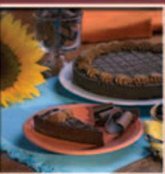
Chocolate Truffle Torte A chocolate lover's fantasy. This dense, fudgy, dark chocolate torte is topped with a piping of chocolate cream cheese and a dark chocolate drizzle.