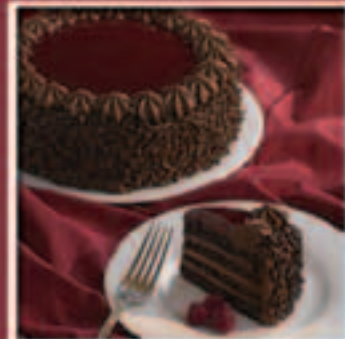
Raspberry Chocolate Cake A perfect combination of raspberry and chocolate, this cake has four layers of moist chocolate cake with chocolate mousse and red raspberry purée between each layer. Creamy chocolate frosting surrounds the cake with mini-gourmet chocolate curls on the side, capped with a thin layer of red raspberry purée and chocolate frosting decoration.