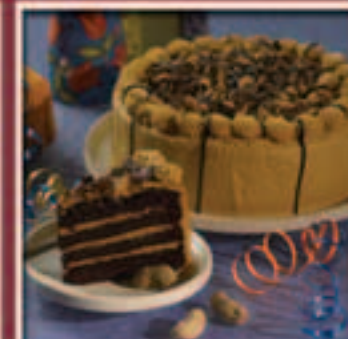
Peanut Butter Cup Triple Chocolate Cake Natural creamy peanut butter frosting surrounds four layers of moist, densely textured chocolate cake. Chopped peanut butter cups and chocolate drizzle add just the right finishing touch to the richest of chocolate cakes.