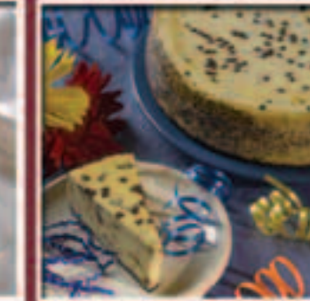
Chocolate Chip Cheesecake A perfect union of chocolate and cheesecake. The chocolate cookie crust nestles creamy cheesecake laced with chocolate shavings. A sprinkle of miniature chocolate chips tops this excellent dessert.