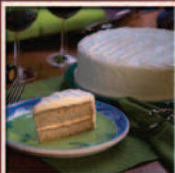
Banana Cake An enjoyable taste of real bananas is found in this double layer buttermilk cake topped with whipped butter cream frosting.